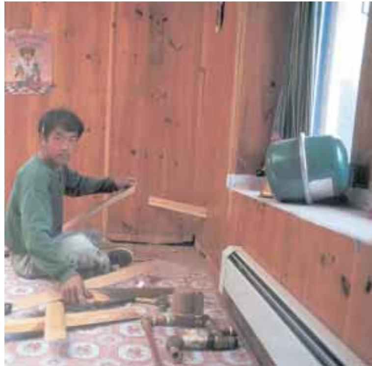
A Sherpa carpenter builds the corner cabinet to house the hydronic system. System parts are in the foreground.

This small hydronic system is intended to pump a moderate amount of heat around the building, and to do so continuously. The thermostats ensure that the system cycles on and off until the building reaches temperature, and then holds it there. Any solar gain through the skylight during the day augments the total heat requirement.