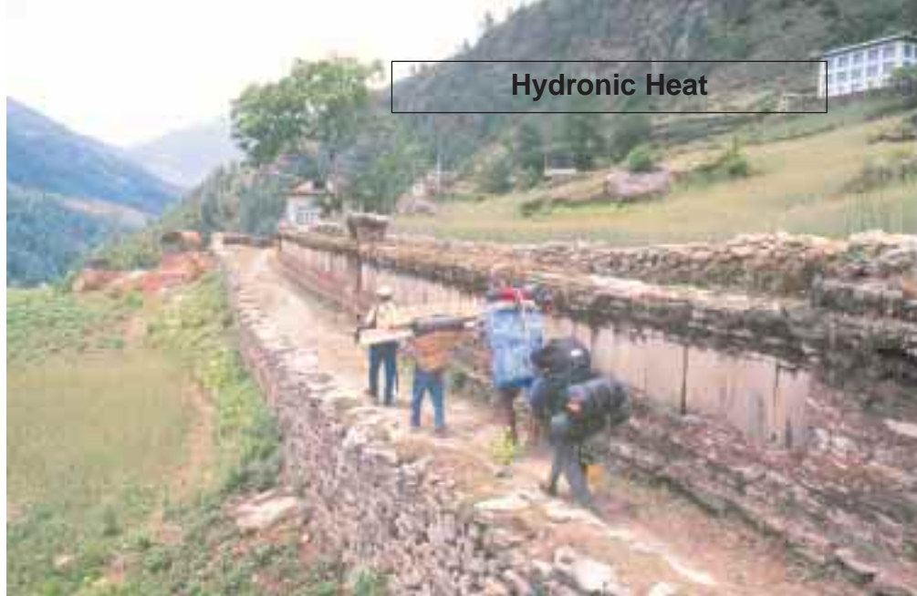
Porters on the long road to Namche.

The Everest Marathon decided to put some effort into upgrading several features of the clinic, to improve the solar absorption in general, and to install some form of heating system. The funding for this project was provided by the Everest Marathon and the Jean-Pierre Michaud Fund of Geneva, Switzerland. The Marathon paid all equipment and in-country expenses,