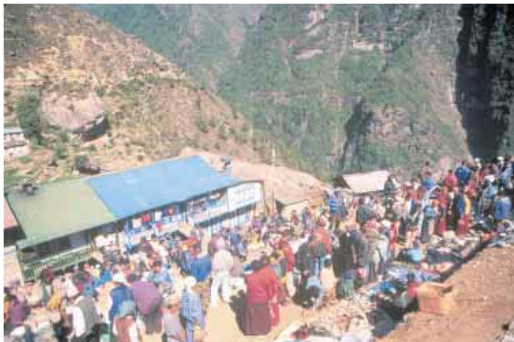
A Saturday market crowd at the crossroads of the Himalayas. Some travel from as far as Tibet to trade here.

I flew into Shyangboche, an hour above Namche