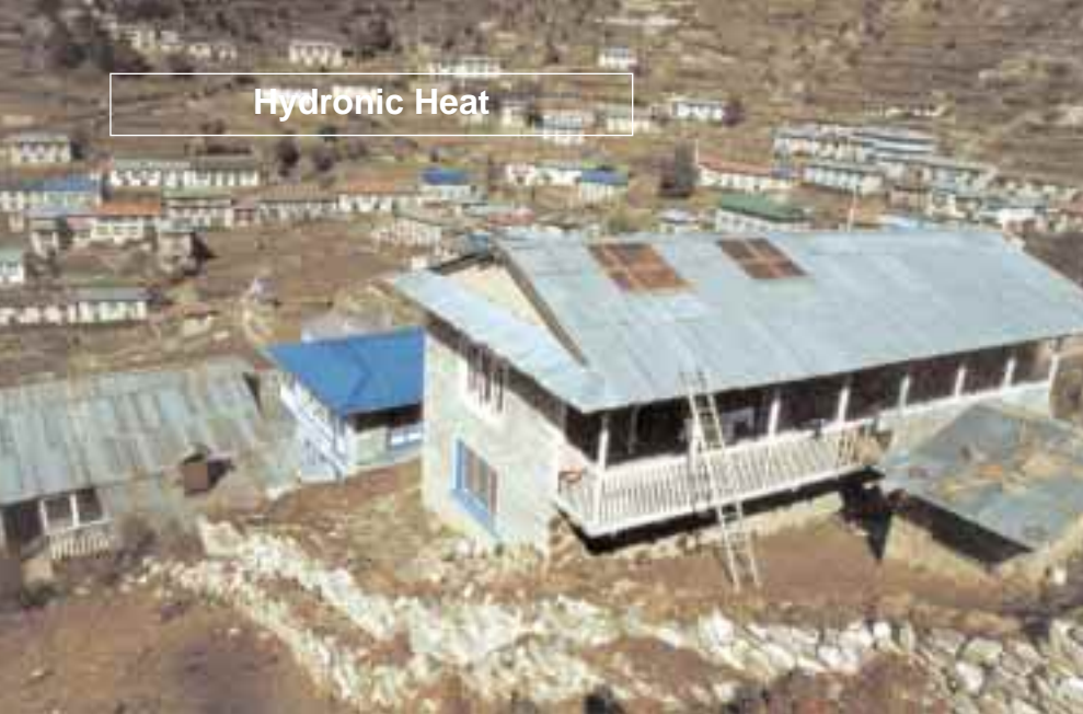
The Namche Bazaar dental clinic, overlooking town. New skylights add natural light and solar gain.